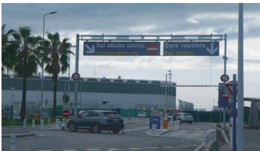
3. Enter the restricted area “Bus Station”.