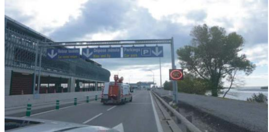
2. Follow Parking – keep right.