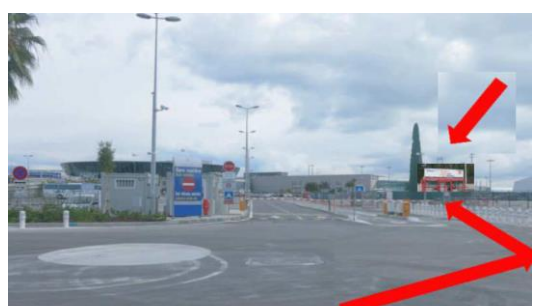
4. Enter through an automated gate then look for the (red) TT Car office.