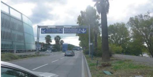
1. Nice Airport Azure direction Terminal 2.