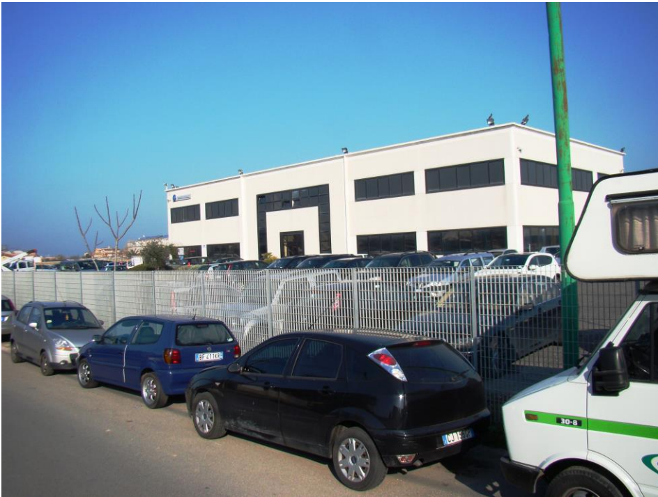
View of building from the road.