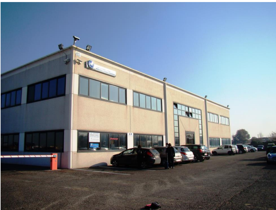
Building – inside gates.