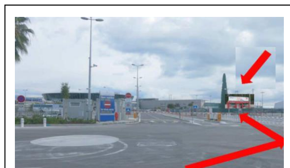
4. Enter through an automated gate then look for the (red) TT Car office.