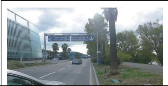
1. Nice Airport Azure direction Terminal 2.