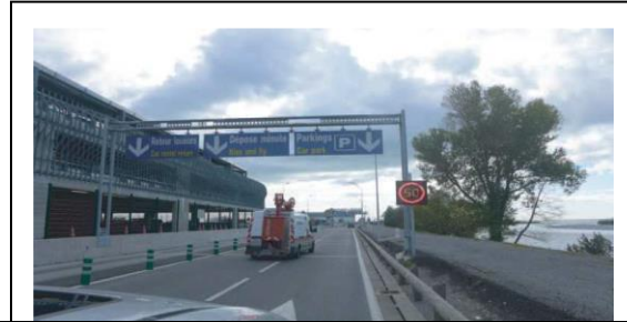
2. Follow Parking – keep right.